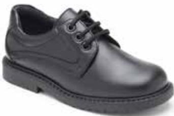
Reception to Year 12

All uniform items (with the exception of the socks and school shoes) must be the official Tenison Woods College monogrammed uniform pieces