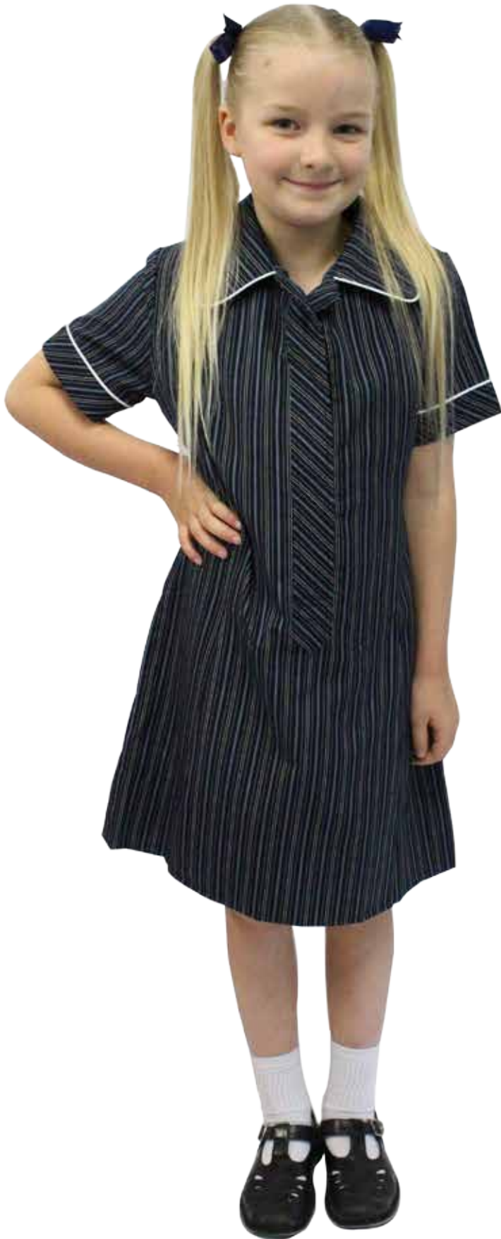
Year 3 - 12 Summer Dress