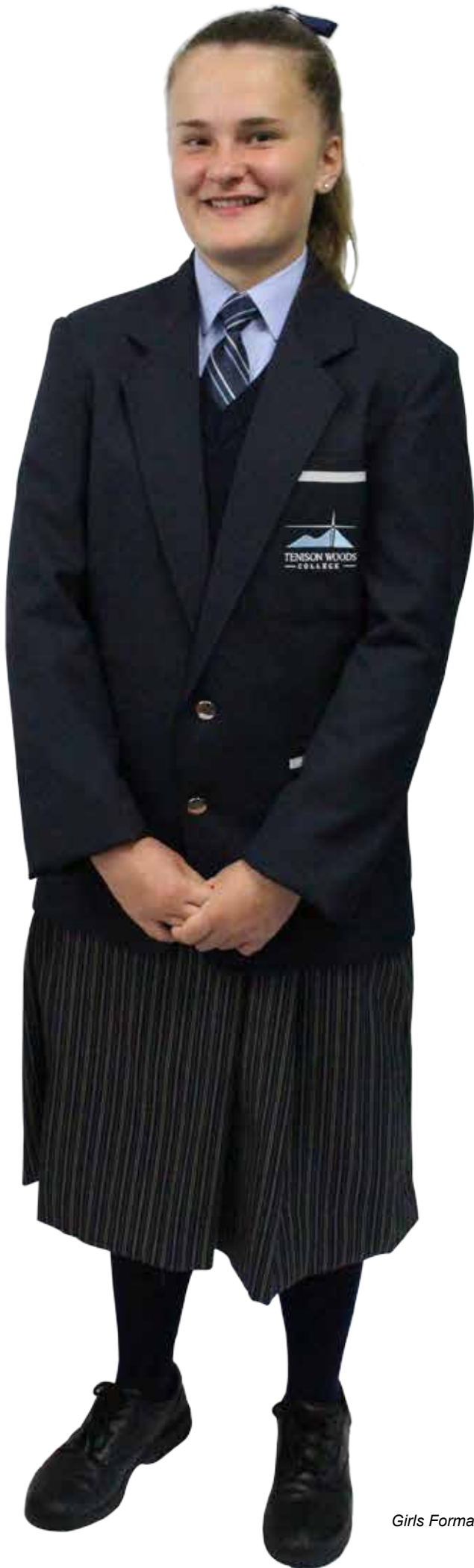
Girls Formal Uniform