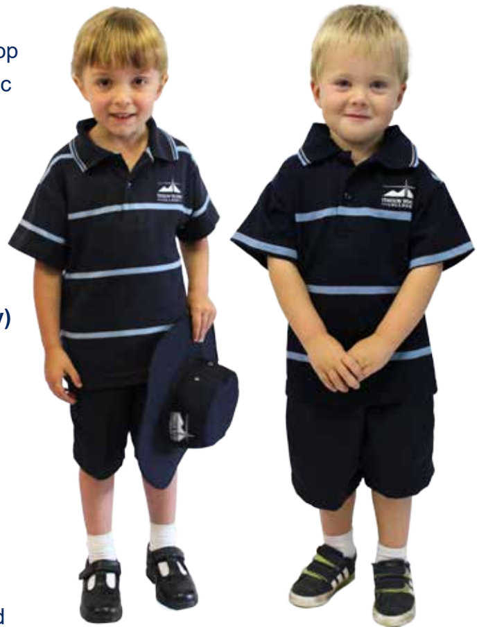
ELCC Summer Uniform

All pieces of the Early Learning uniform are unisex and can be interchanged for wearing in summer or winter, allowing for comfort in all weather conditions.