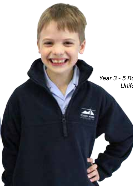
Year 3 - 5 Boys Winter Uniform option