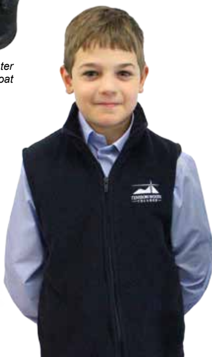
Year 3 - 12 Boys Winter Uniform with navy raincoat

All uniform items (with the exception of the socks and school shoes) should be the official Tenison Woods College monogrammed uniform pieces.