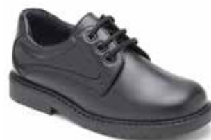
Reception to Year 12