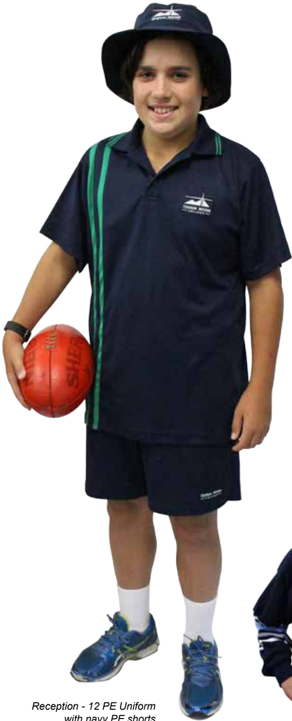
Reception - 12 PE Uniform with navy PE shorts