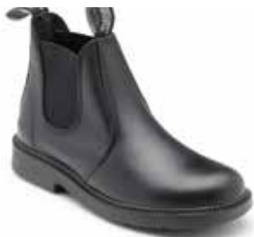
Reception to Year 5