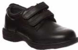
Reception to Year 5