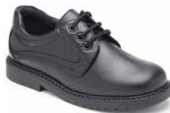
Reception to Year 12