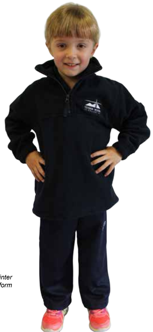
ELCC Winter Uniform