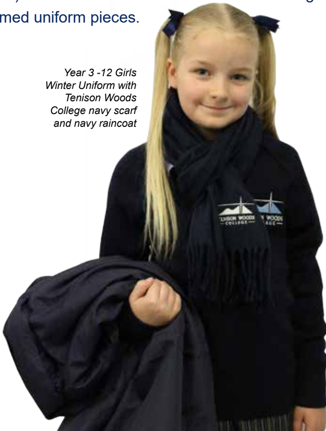
Year 3 -12 Girls Winter Uniform with Tenison Woods College navy scarf and navy raincoat

All uniform items (with the exception of the socks, tights and school shoes) must be the official Tenison Woods College monogrammed uniform pieces.