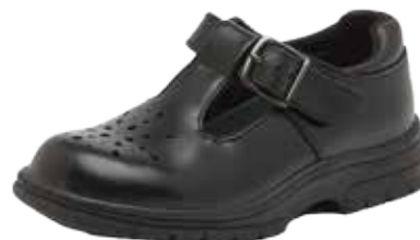
Reception to Year 12