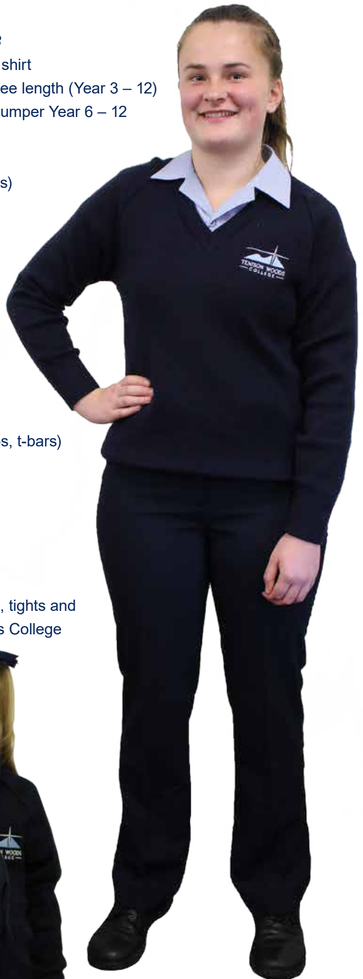
Year 3-12 Navy trousers