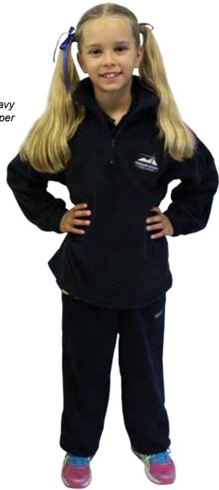
Year 3 - 12 PE rugby top