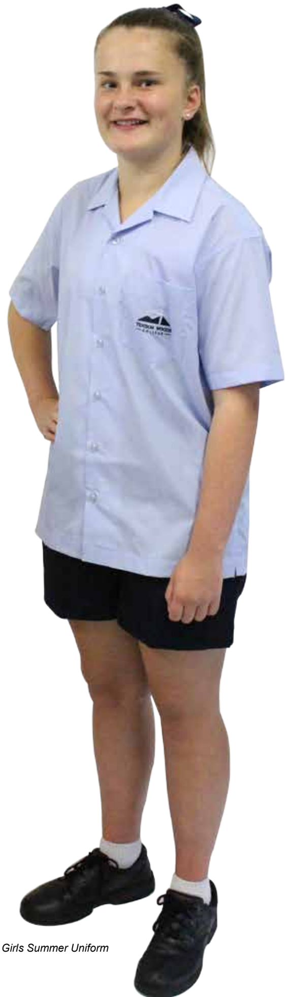
Year 3 -12 Girls Summer Uniform