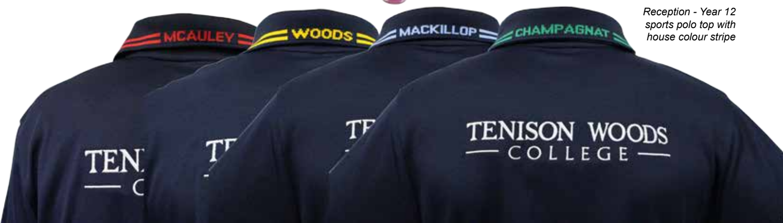
Reception - Year 12 sports polo top with house colour stripe