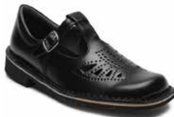
Reception to Year 12