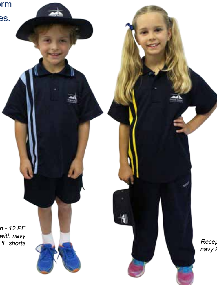
Reception - 12 PE Uniform with navy PE shorts