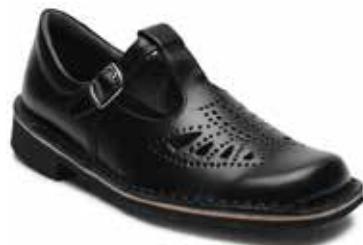
Reception to Year 12