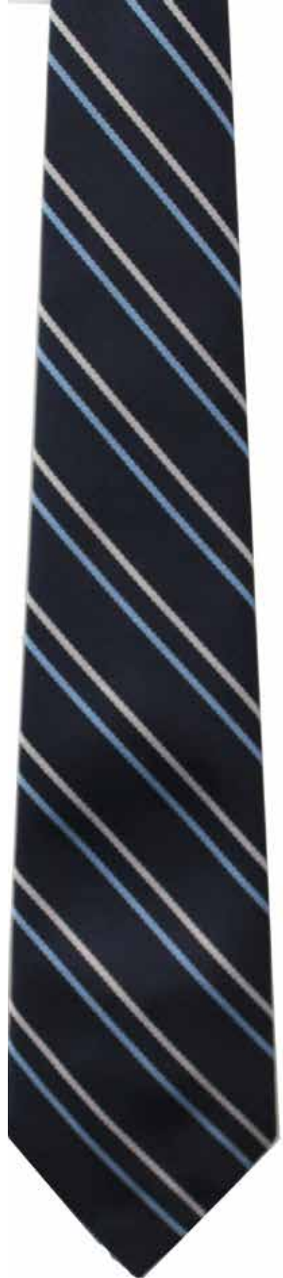
Tenison Woods College tie