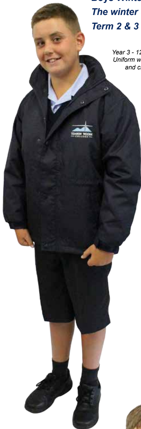
Year 3 - 12 Boys Winter Uniform with navy scarf and charcoal pants