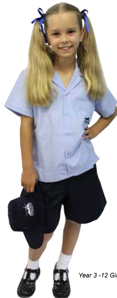
Year 3 -12 Girls Summer Uniform