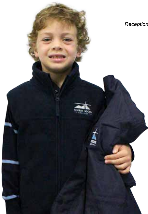
Reception - Year 2 Winter Uniform

It is well researched that play in the early years (Early Learning – Year 2) is vital to a child's development and it is good practice to have play based activities and learning experiences. With this in mind and considering parent feedback, we have provided a uniform that supports children's play and learning.