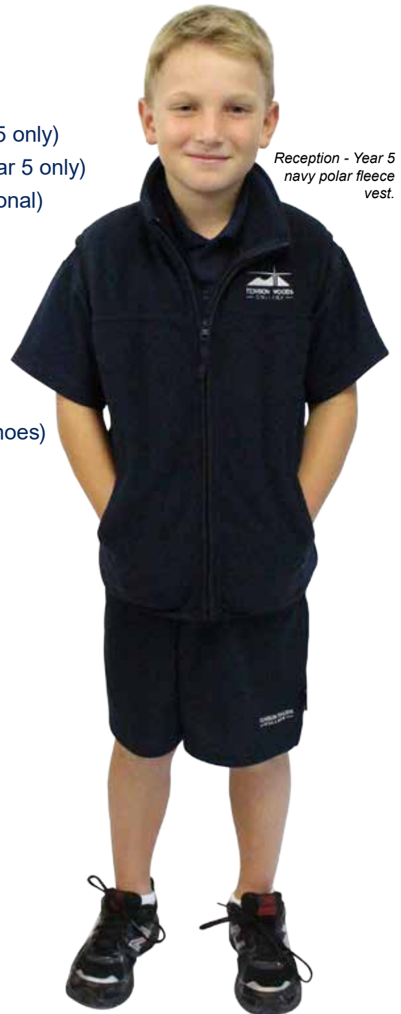
Reception - Year 5 navy polar fleece vest.

All uniform items (with the exception of the socks and sport shoes) should be the official Tenison Woods College monogrammed uniform pieces.