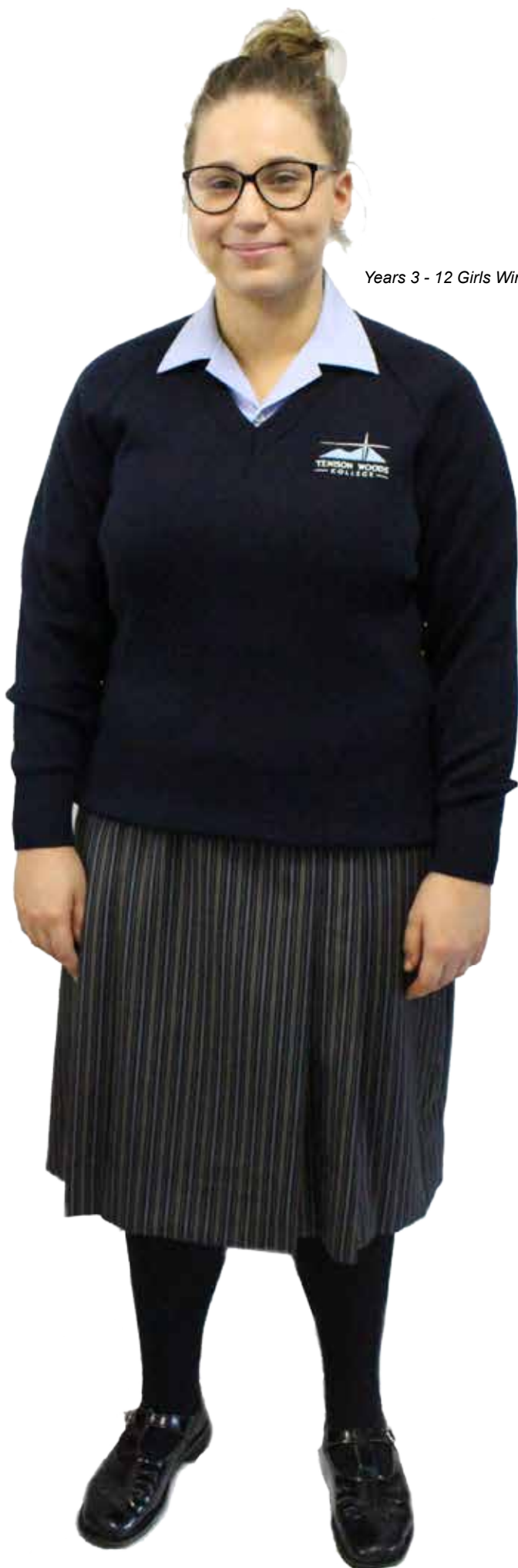
Years 3 - 12 Girls Winter Uniform