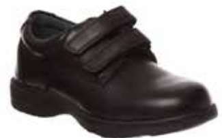
Reception to Year 5