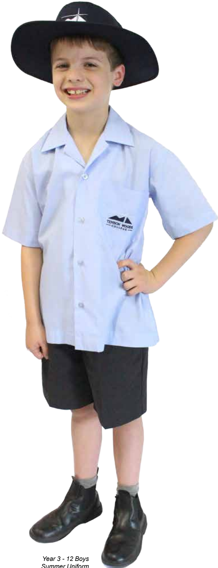
Year 3 - 12 Boys Summer Uniform

All uniform items (with the exception of the socks and school shoes) must be the official Tenison Woods College monogrammed uniform pieces.