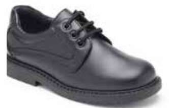
Reception to Year 12