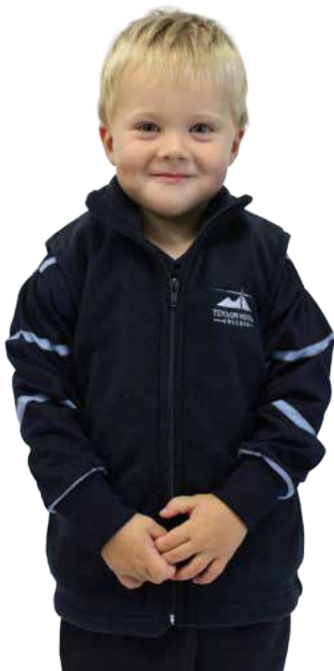
ELCC Winter Uniform